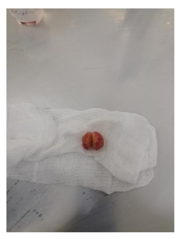
Figure 4: The tumor after complete excision.

The histopatological examination showed Sertoli cell adenoma (Myer's type 1) with no evidence of increased mitotic activity. The line of excision was free of tumor. After surgery gynaecomastia regressed gradually and disappeared after 18 weeks. Follow up for 18 months, by physical examination and ultrasonography there was no recurrence of the tumor and no testicular atrophy.