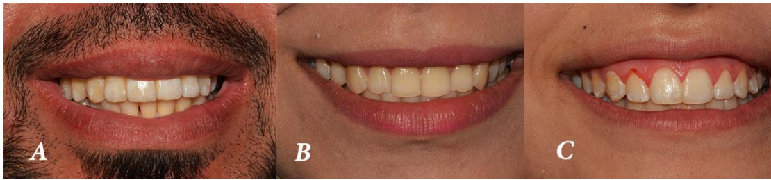
Figure 3. Smile types (A, low smile; B, average smile; C, high smile)