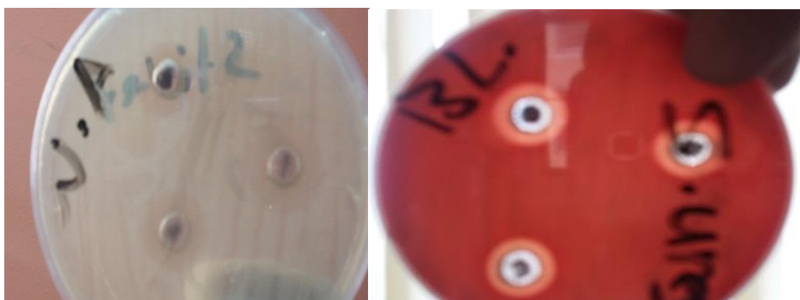
Fig (3): inhibition zones of bacteria

The results shows that the nanoparticles have strong activity against gram negative and gram positive bacteria and have more activity against E-coli than Staph . the activity of the Nanoparticles against bacteria have been reported by many studies ,but the mechanism of bactericidal effect of nanoparticles is not very well known, some studies have reported that the electrostatic attraction between positive charge of silver Np and negative charged cell membrane of microorganism [Hamouda, 2000; Dibror et al. , 2002; Dragieva et al. , 1999],other studies reported that the oxidation react at the surface of nanoparticles silver ion diffusion ,thus causing structural change and finally bacterial will die. (Melinte et al. ,2011).